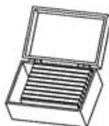
Slide box with 5 prepared slides & 5 blank slides